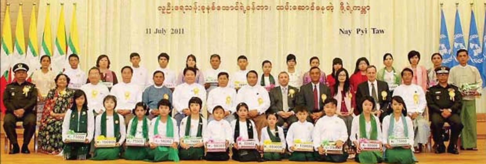
Prize winners of various competitions on World Population Day 2011, with the Ministers, Government Officials, Diplomats and UN Representatives, in Nay Pyi Taw, Myanmar.

UNFPA and the Ministry of Immigration and Population (MOIP) jointly organized a ceremony commemorating World Population Day in Nay Pyi Taw on 11 July, with the theme “The World at 7 Billion”. Ministers, deputy ministers, government officials, diplomats, representatives of United Nations agencies, NGOs, and winners of various contests participated in the event.