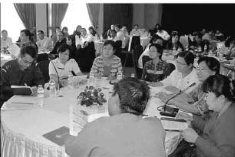
Representative of government, national and international NGOs, the United Nations and donors participated at the stakeholders meeting in Nay Pyi Taw, Myanmar, to develop the third Programme of Assistance.

With the conclusion of the second Programme of Assistance (PoA) in December 2011, UNFPA country office, the Government and other stakeholders, developed the third Programme of Assistance (2012-2015) based on: the Situation Analysis on Reproductive Health, Population and Development and Gender conducted in 2010; the End-of-Programme Evaluation 2011; the United Nations Thematic Analysis and United Nations Strategic Framework 2012-2015; and lessons learned from the second Programme of Assistance.