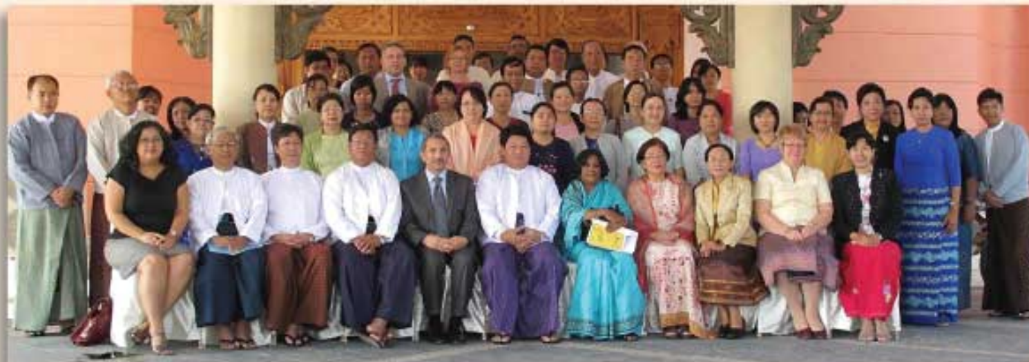
Participants of National Consultative Meeting on Reproductive Health, Maternal, Neonatal and Child Health in the Context of Rural Development and Poverty Reduction Strategies, 7-8 November, 2011, Nay Pyi Taw, Myanmar.

UNFPA and the Ministry of Health jointly organized the National Consultative Meeting on Reproductive Health, Maternal, Neonatal and Child Health in the Context of Rural Development and Poverty Reduction Strategies in Nay Pyi Taw on 7 and 8 November. The objectives of the meeting were to review progress under the National Reproductive Health Strategy and to share experiences of countries in the South East Asia region on reproductive health, maternal, neonatal and child health interventions for achieving the Millennium Development Goals (MDG).