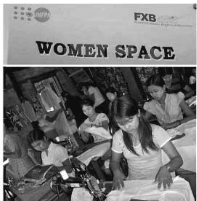
At the Women Space in Labutta Township, Ayeyarwaddy Region, Myanmar, women beneficiaries are being supported with tailoring training organized by FXB and supported by UNFPA.

Mr. Abdel-Ahad concluded by calling on all stakeholders to support the implementation of the National Strategic Plan for the Advancement of Women.