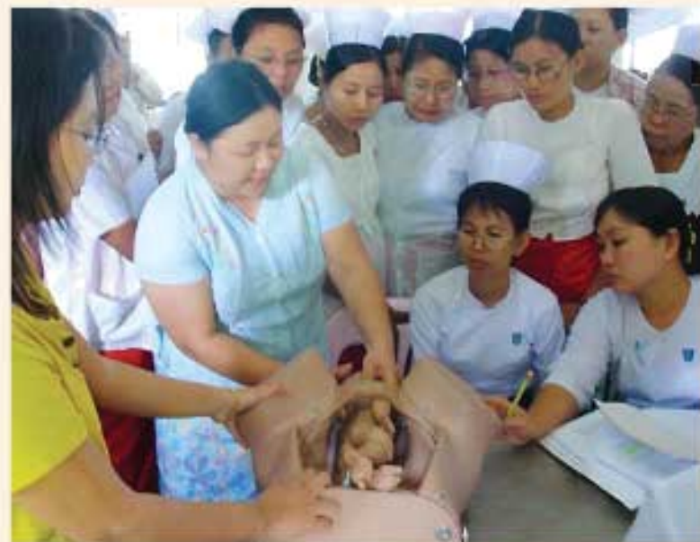
Basic Health Staff from Tharyarwaddy Township, Bago Region, being trained on Pregnancy, Child Birth, Postpartum and Newborn Care (PCPNC)

the public sector. Under the other new project "Promoting Access to Adolescent Sexual and Reproductive Health and HIV Information by university students," the MMA Youth Development Programme promotes access to adolescent sexual and reproductive health and HIV prevention information by university students in five areas. There have been no such interventions before, despite the prevalence of RH problems among university students. This project utilizes trained peer educators to reach to their peers from universities and disseminate the correct messages and information. Taking advantage of youth's creative and innovative ideas, appropriate mass media such as DVDs, telephone help-lines and mobile edutainment teams are used for effective dissemination of information.