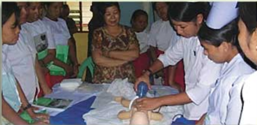
Basic Health Staff are being trained on Pregnancy, Child Birth, Postpartum and Newborn Care (PCPNC) with the support of the German Fund.