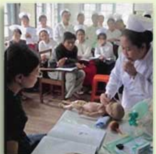
Basic Health Staff from Pinlaung Township, Shan State, Myanmar, are being trained on Pregnancy, Child Birth, Postpartum and Newborn Care (PCPNC) with the support of the German Fund.

By: Midwife, Kyaukpadaung Township Hospital