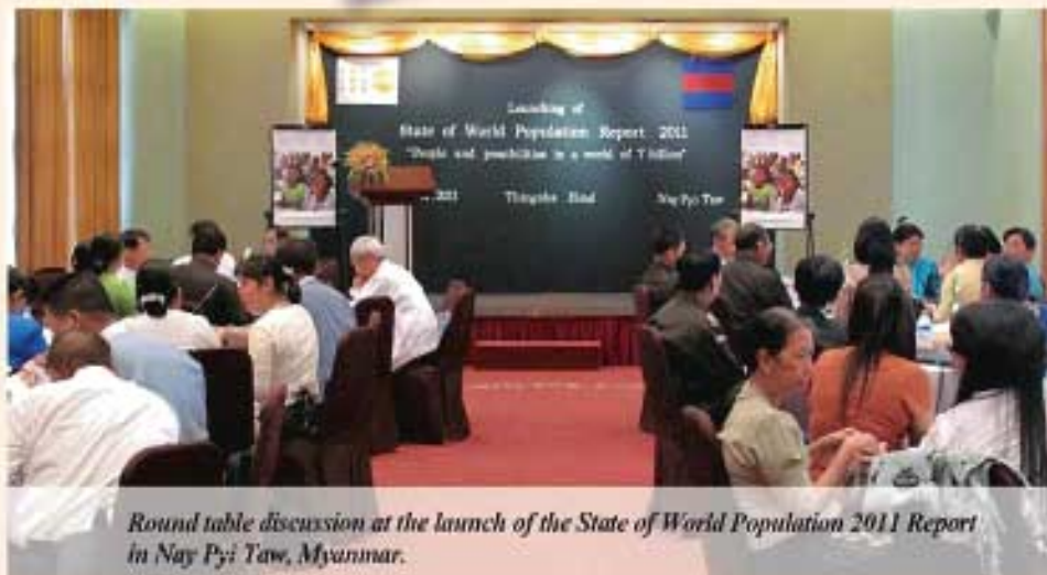
Round table discussion at the launch of the State of World Population 2011 Report in Nay Pyi Taw, Myanmar.