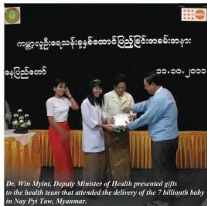
Dr. Win Myint, Deputy Minister of Health presented gifts to the health team that attended the delivery of the 7 billionth baby in Nay Pyi Taw, Myanmar.

Ensuring safe motherhood and universal access to reproductive health is the primary goal of UNFPA. Our common goal of improving maternal health and saving women's and children's lives can be achieved only if