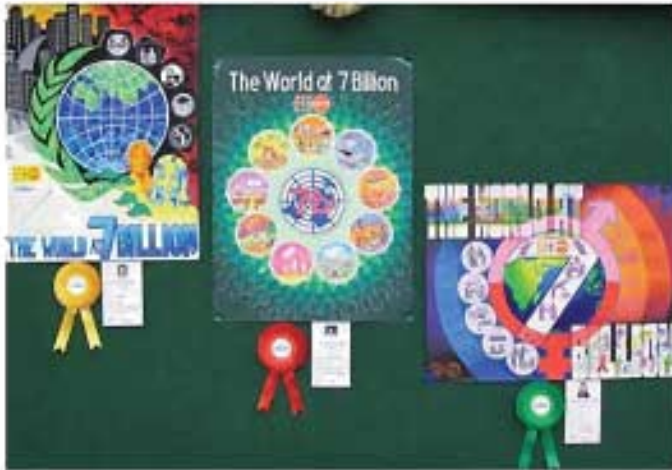
First, second and third prize winning posters on World Population Day 2011 displayed at the event in Nay Pyi Taw, Myanmar.